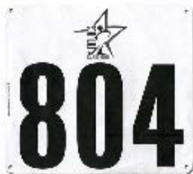
A sample race bib

Bib timing is the term we use for an alternate form of timing that utilizes race bibs or tags for timing but is still organized by a company. Bib timing is traditionally less expensive than chip timing, with estimates sometimes ranging around $700 or lower. Some companies use innovative methods such as electronic tags or bracelets to electronically score race participants. The race company my team and I hired would download our online registrants and then print labels that displayed all of an individual's information. These labels would then adhere to race bibs. When using any company, ask them about their procedure for how to obtain race bibs. For the rest of the guide, I will assume your team utilizes a race bib system.