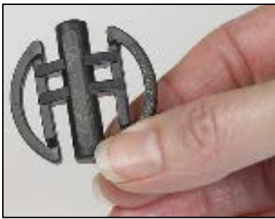
A sample chip used for timing

Chip timing is considered by many to be the best form of timing, albeit often the most expensive. Chip timing works by having runners interlink an electronic disk into their shoes when they race. Using a special cord, the chips are removed at the finish line and then processed for results.